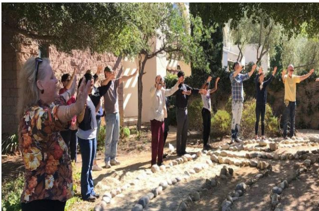
Newly enlarged Labyrinth